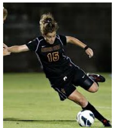
Holland in action on the soccer field.

Learn more about the Educational Studies program : http://education.asu.edu/edstudies