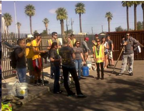
Tutors listen to the safety debriefing